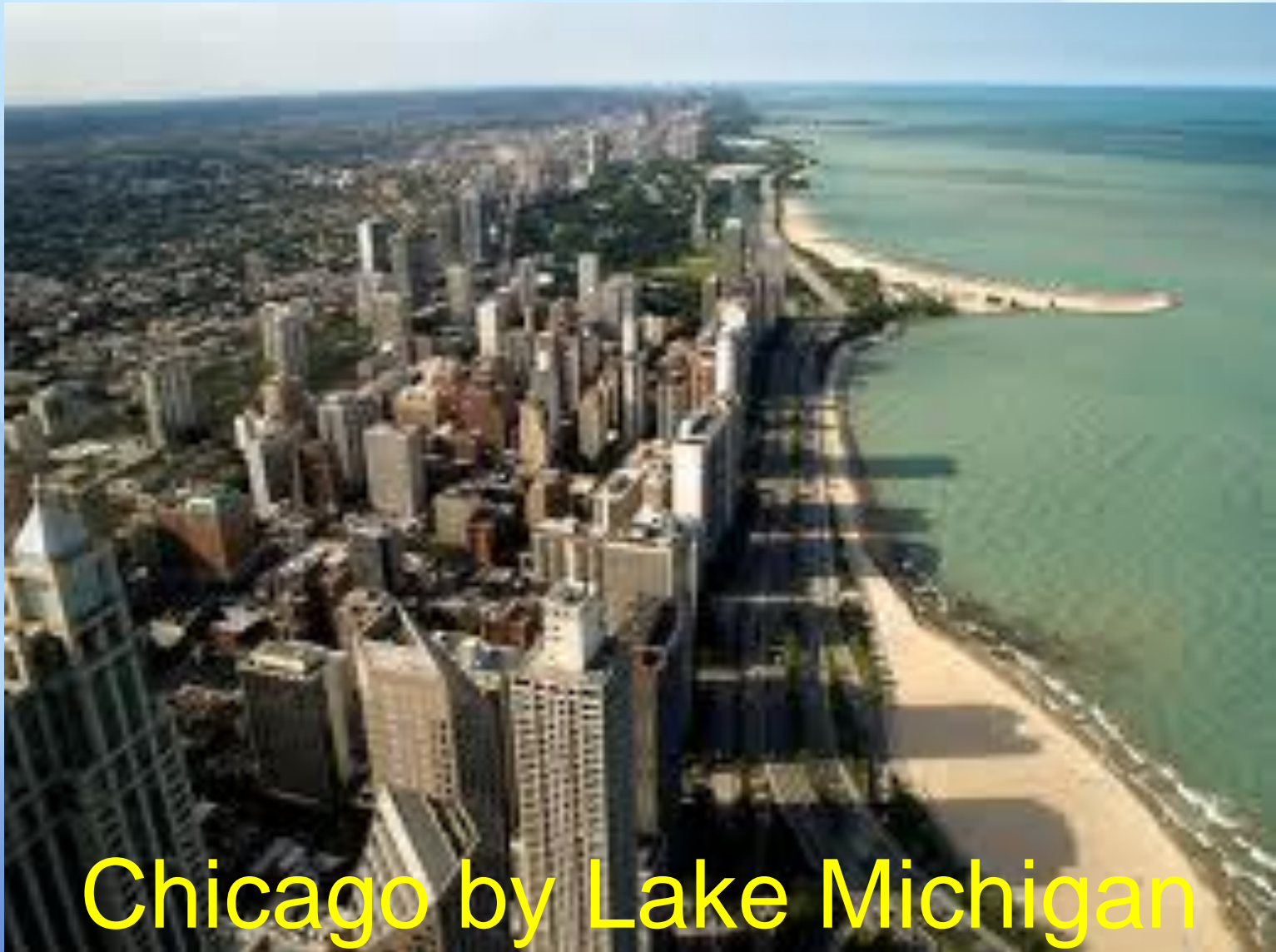
Chicago by Lake Michigan