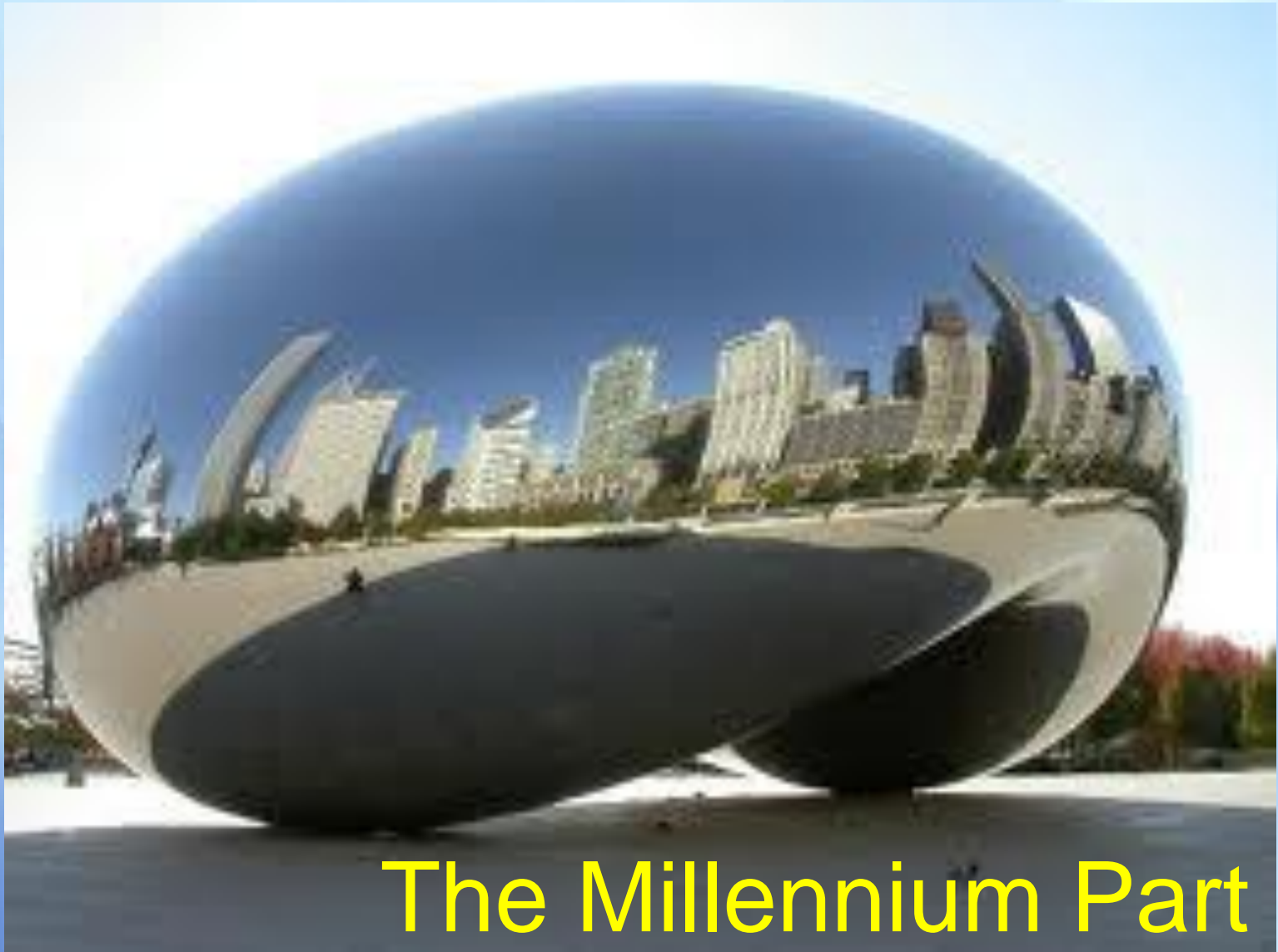
The Millennium Part